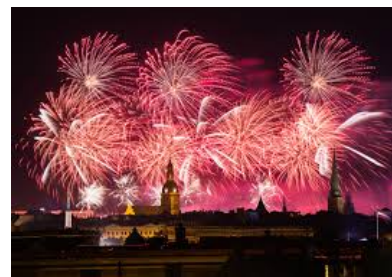
Song and Dance Festivals